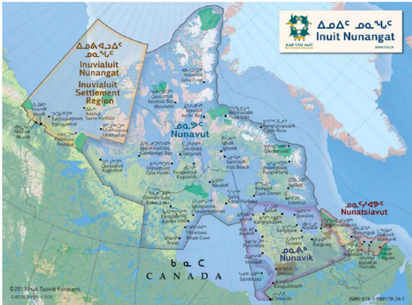
Figure 3. Inuvialuit Settlement Region and Nunavut Settlement Area